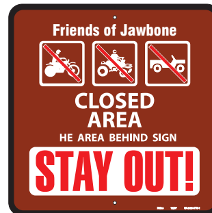
24" x 24"

Ensure visibility from both the front and the back by having a warning message printed on both sides. The back side message is laid out to accommodate the support post.