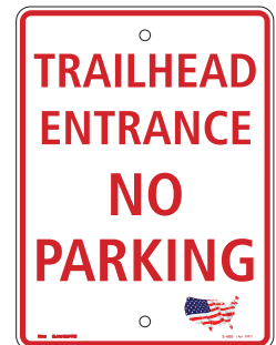
9" x 12"