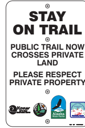
12" x 18"

Screen Printed RhinoPoly™ Signs River Crossing Signs Wrap-A-Round Signs