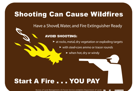
13 1/2" x 9 1/2"