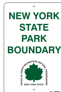
8" x 12"